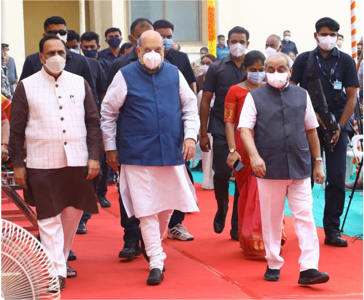
Gujarat Chief Minister Shri Vijay Rupani, Deputy Chief Minister Shri Nitin Patel and senior officers of Gandhinagar district were present on the occasion.