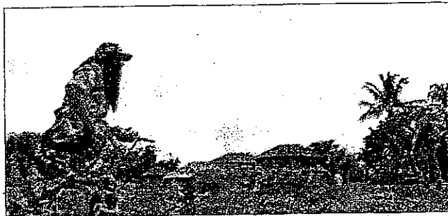
Maoists have threatened to blow up all double and multi-storey buildings

Caught in a bind, the government is making plans for construction of single-storey buildings to save the property from damage, says a source. "After a