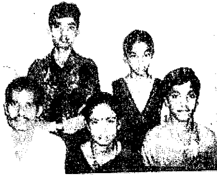
Family Members Details