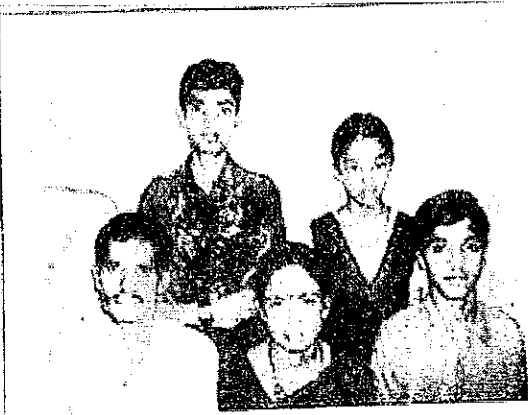
Family Members Details