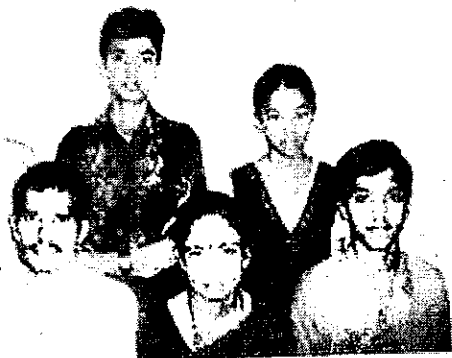
Family Members Details